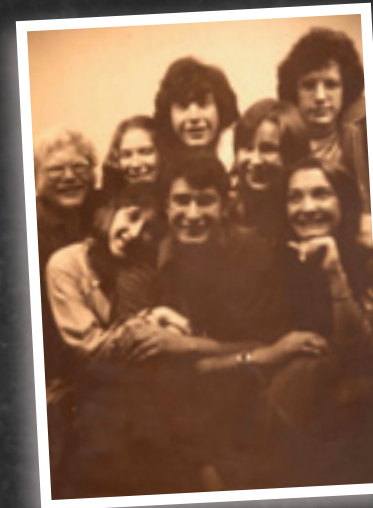
Jackson State Fair, Jackson, Miss., 1976