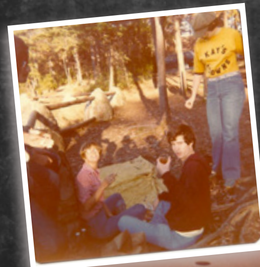
National Association of Honors Colleges (now NCHC), Ohio, 1977