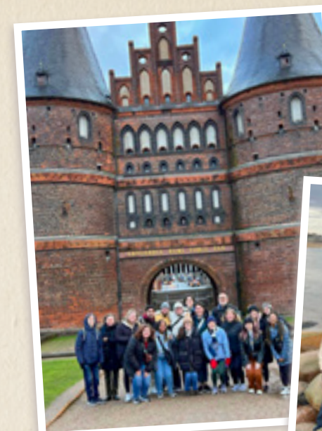
Honors Abroad in Germany

Scan here to listen to the song students wrote!