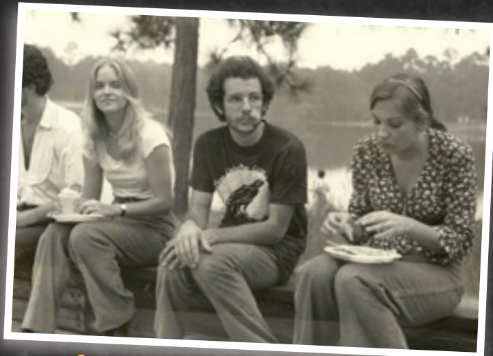
Paul B. Johnson State Park, 1977