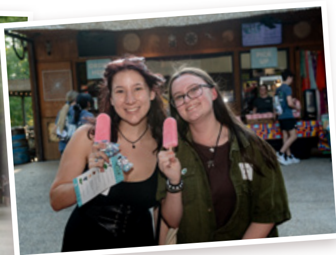
Start of the year social at the Hattiesburg Zoo