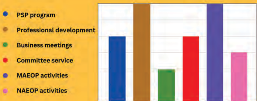
ABOVE - Surveyors were asked a series of questions about their participation in AOP activities. The results show that our professional development programs and the recent MAEOP seminar were the most popular.